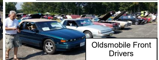
Oldsmobile Front Drivers