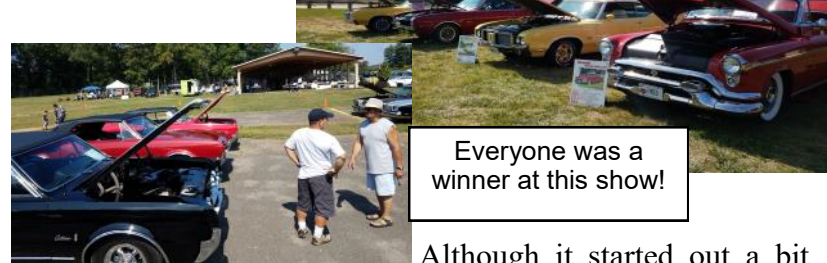
Everyone was a winner at this show!

Although it started out a bit dreary, the sun did shine and it brought the temperature up to convertible standards quite quickly! #