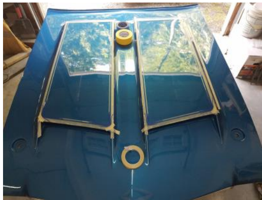
Adding stripes to a '71 OAI Hood

The weather is starting to get a bit warmer, hopefully everyone has a nice heater in the garage (or got one for Christmas) so you can get out there and make those improvements that always seem to be a last minute thing right before the first car show or the Nationals!