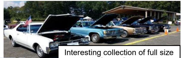
Interesting collection of full size sitting in front of the pavilion.

How many of us still remember riding in the back of one of these?