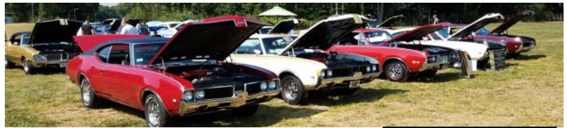
There were plenty of '69's in attendance.