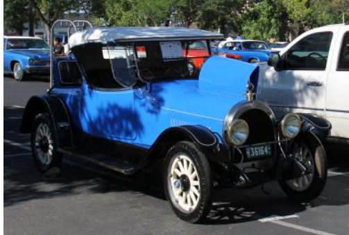
How's this for a sporty little 2 door?

Despite being one of the farthest geographically from the host hotel in Albuquerque, NEOC was one of the better represented clubs in attendance. Although the distance exceeded what would normally be considered "driveable", the airlines and rental car agencies made money off of us New Englanders in July. The weather was pretty nice and we tried to