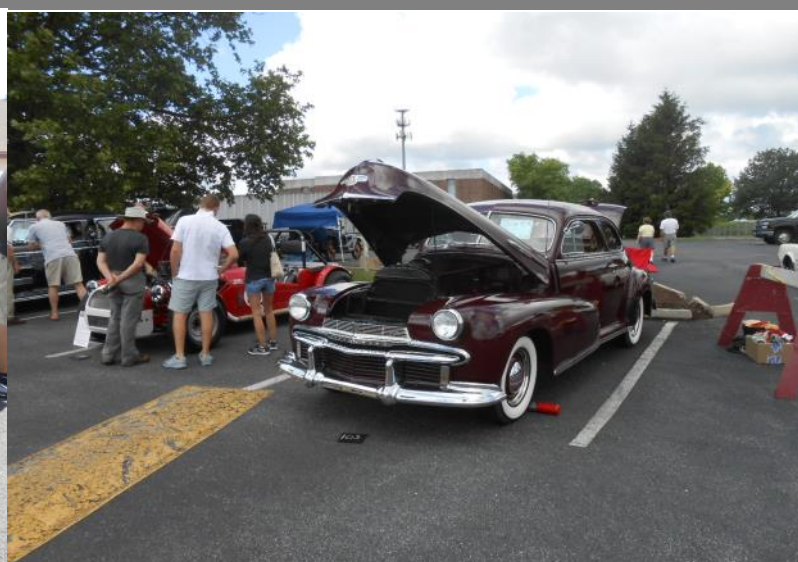
Tweed Vorhees 1942