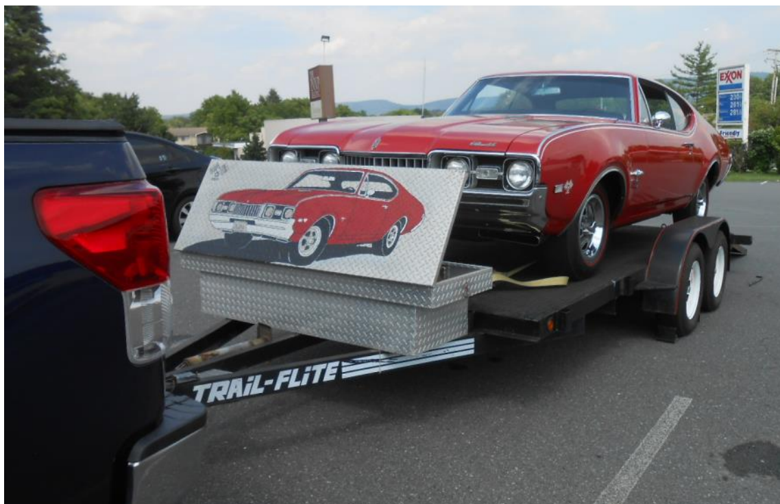
Yours truly at the host hotel unloading