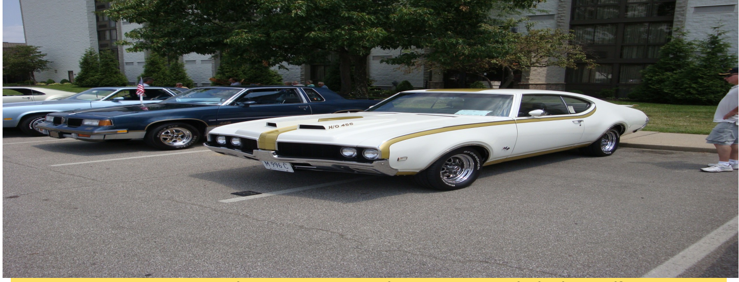
OCA 2014 Nationals, Cincinnati, OH—Is that green grass in the background?