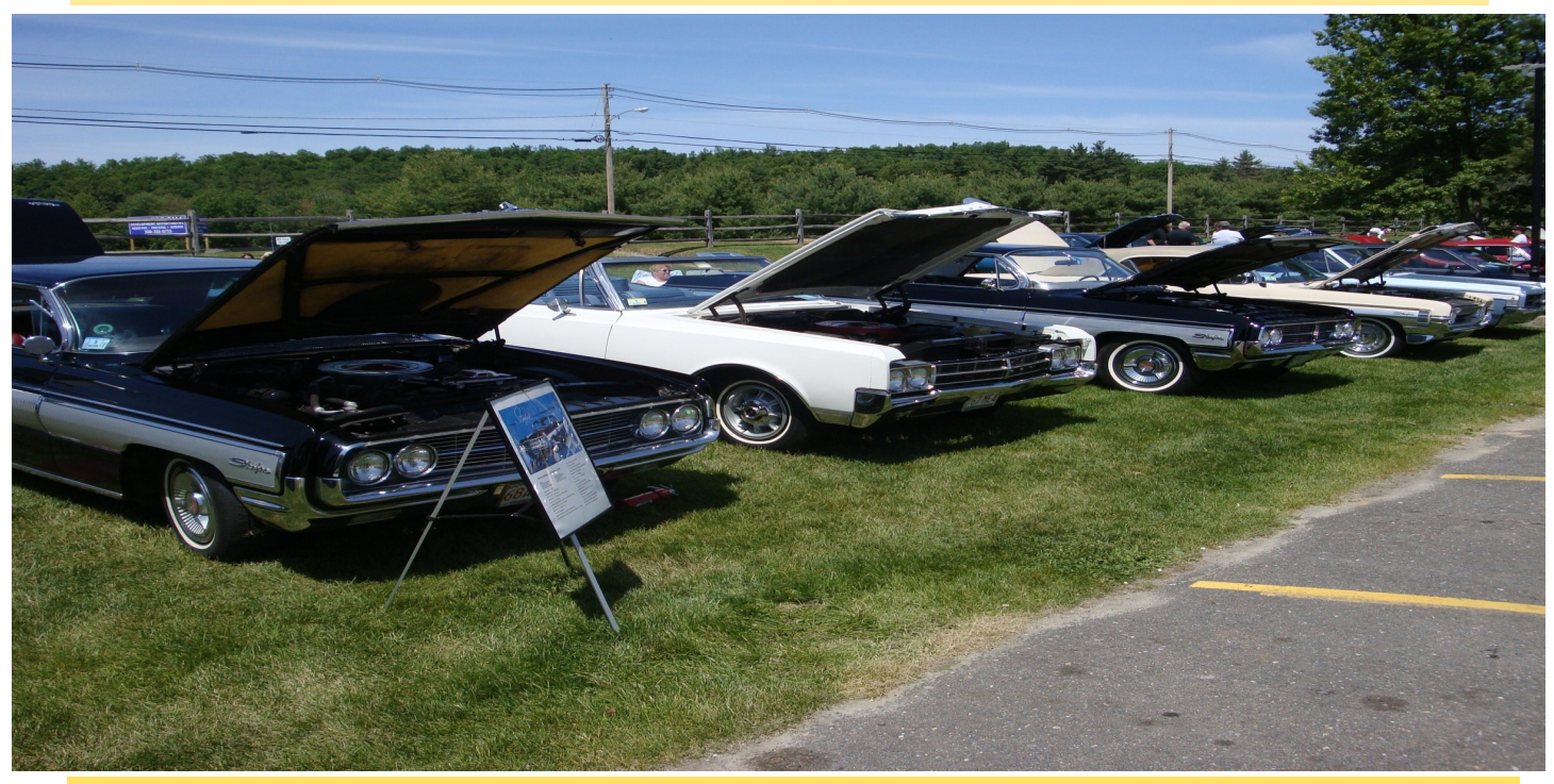
Oldsmobile Starfire row at the GMO Dustoff.