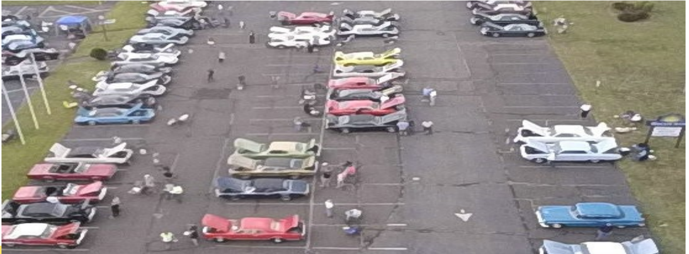
Aerial Photo from the 2014 NEOC All Oldsmobile Show