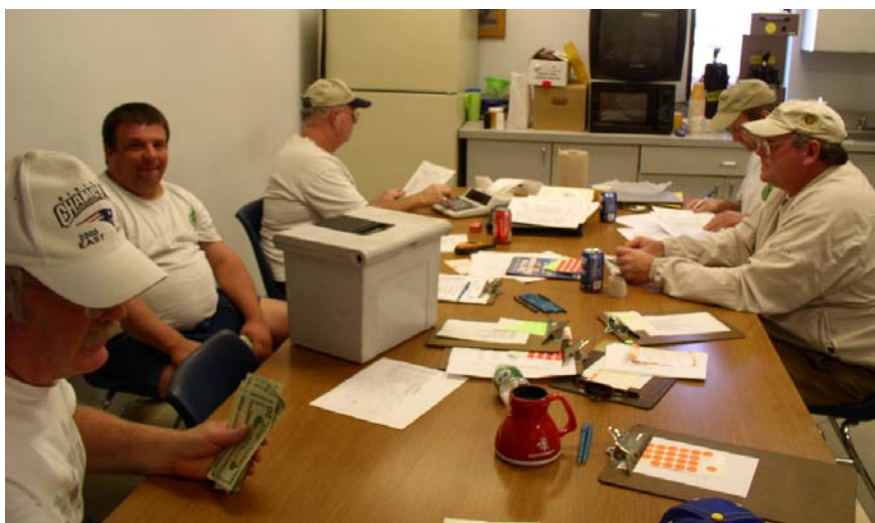
A once in a lifetime look at the frantic pace behind closed doors at the car show headquarters...