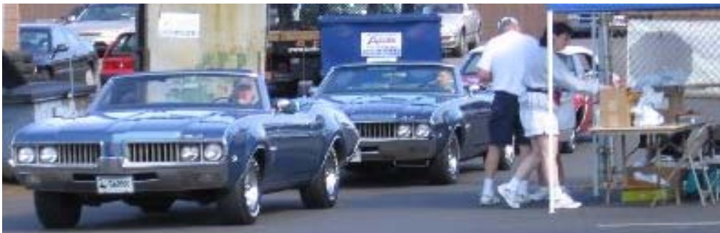
The Roy's got everyone through the gate efficiently all day long!

breakfast sandwiches were good, especially with a little of the hot relish! Of course that might also have to do with the occasional line at the bathroom!