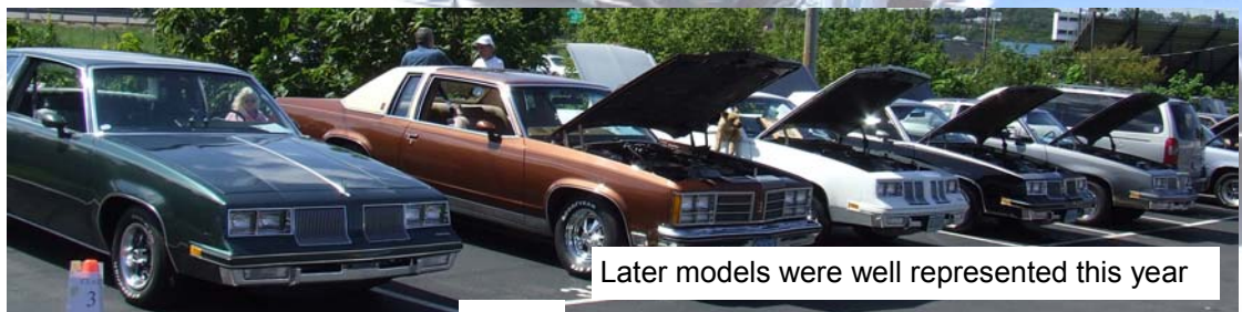
Later models were well represented this year