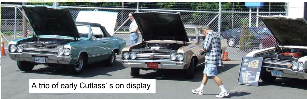
A trio of early Cutlass' s on display