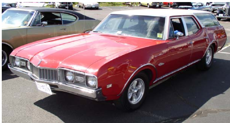
We were glad to see all sizes and shapes of Oldsmobiles at the show including this Olds wagon from 1968

(I personally apologize for any misspelling or incorrect information. Please let me know of any corrections)