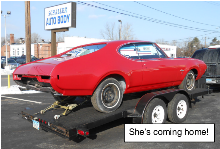
She's coming home!