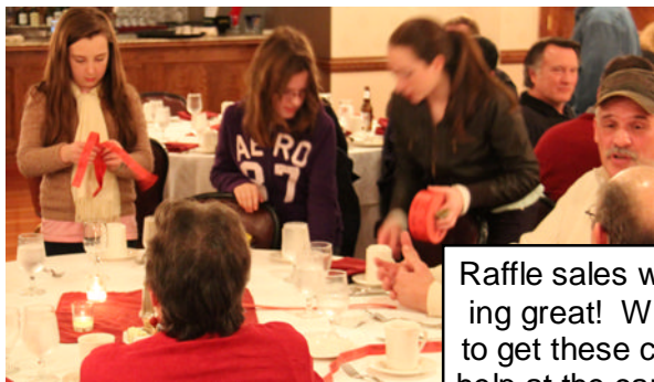
Raffle sales were going great! We need to get these cuties to help at the car show!!