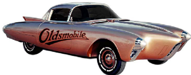
1956 Oldsmobile Golden Rocket Concept Car

Sunday May 17, 2009 - 8AM to 3 PM (Rain Date May 31, 2009)