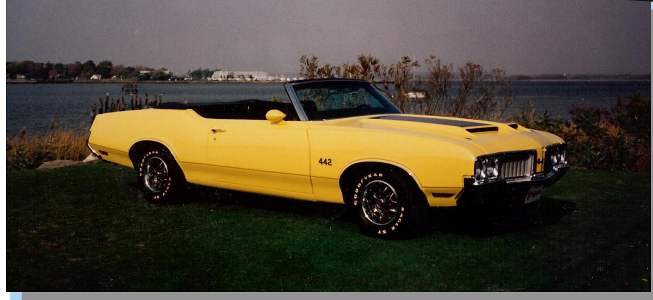
So keep lighting the Rockets. It's been a great ride (so far) with great people at some interesting places. Thank You, to all of our NEOC family for these great memories.

of the awards, were accepted with a great sense of gratitude for the recognition. Now with this first place in Seniors (in 2002) our meet emcee graciously, announces that by winning the Senior class, the 442 needs to take a break and let others win so it is officially retired from judging in the NEOC event. My 442 becomes the first vehicle within the NEOC ranks to have this retirement classification bestowed upon it. In its own right, it's another honor awarded by the members of our club. Our emcee goes on to tell the crowd that "it's time for