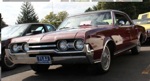
Plenty of award winners!