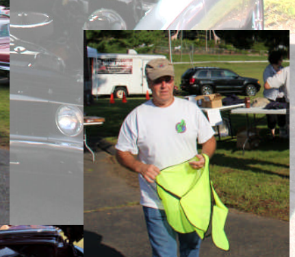
Show's over, time for a cold one