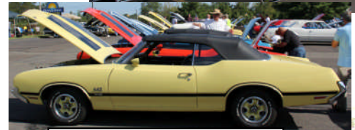
Rows of W-Machines