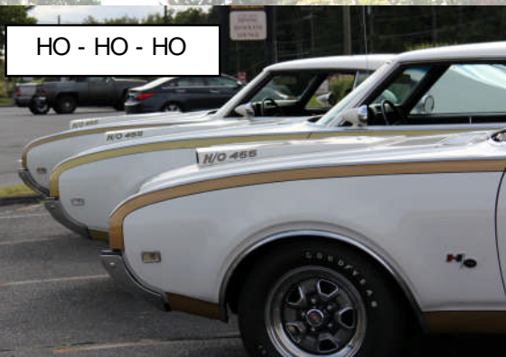
HO - HO - HO