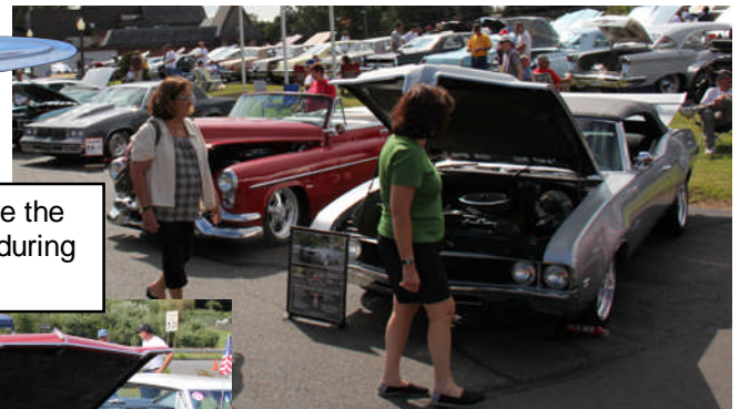
Convertibles were the ideal car to have during this show!