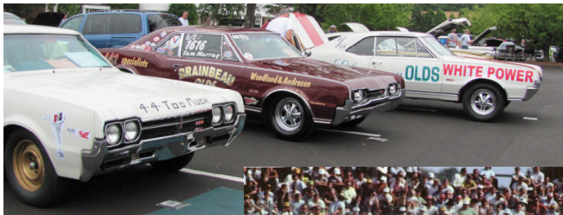
In a rare moment, 3 Olds race cars caught standing still