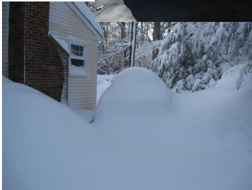
The '69 last winter (yea, it's in there!)

I think that maybe the winter that never was is almost behind us now. There have been a few spring like days in the past month that even motivated me to move one of the Olds. Fired up the Ram-Rod and took the '69 for a quick spin around the block. Worries about gas prices seem to slip away when you're behind the wheel of your Olds. Kind of.