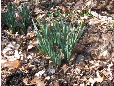
Crocus peeping through leaves in my back yard