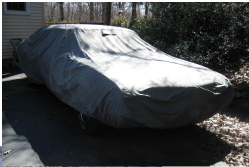
The '69 almost ready to come out and play