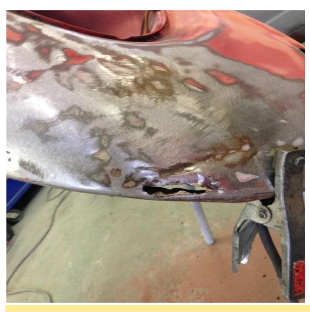
More rust repair....