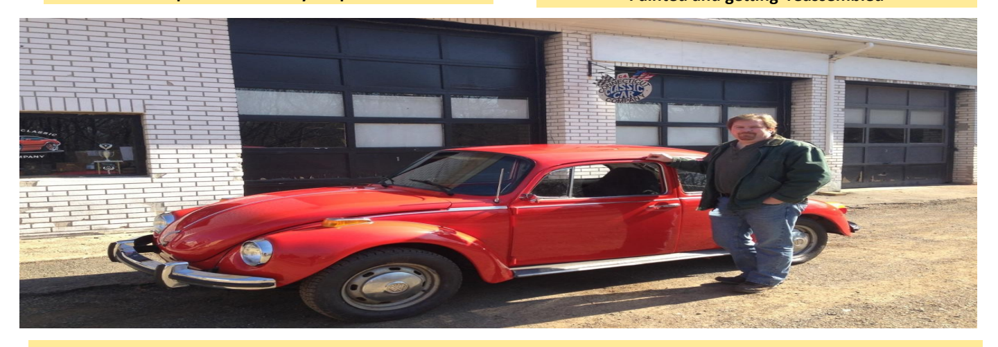
The finished product!!