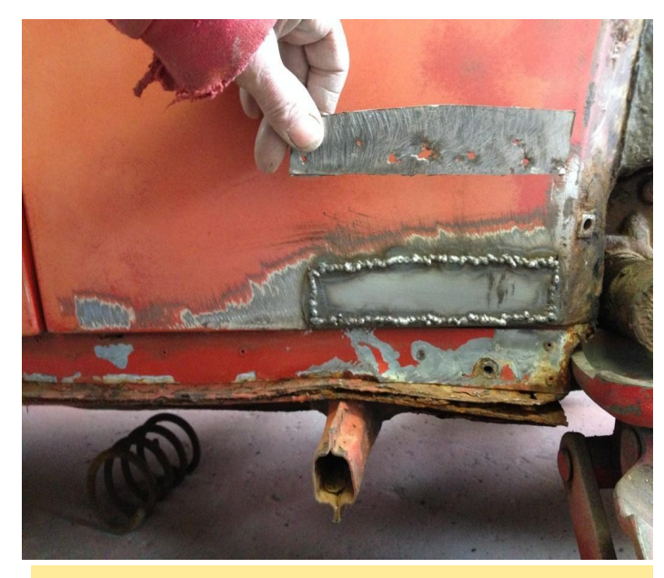
Rust repair work underway