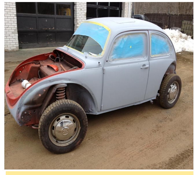
In primer and ready for paint