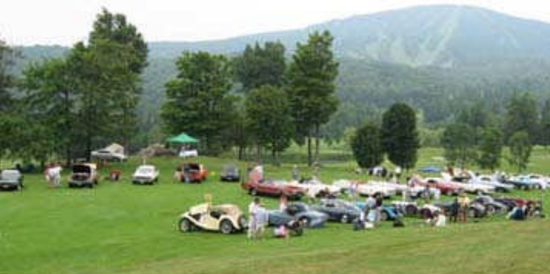
Stratton Mountain Ski Resort looms over the show field. Best of show winner '47 MG TC is visible in the foreground.

In the end the skies never did open up and the event somehow ran its course with only a few sprinkles hitting the hoods of the participant cars. The cloud cover kept the temperatures tolerable and made for glare-free viewing conditions. Look for a complete report in a future edition of Hemmings Motor News. RR