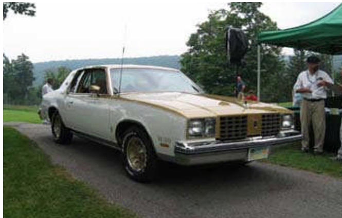
Gene Miller's '79 Hurst Olds At the medal stand at Stratton Mountain, VT

This show did not fit into the mold of a stereotypical car show venue. The competitors were lined up on the spacious and manicured fairway of Stratton's famous golf course. There was no asphalt in sight. Show organizers requested that once vehicles were cleaned for show that all hoods and trunks be closed so that the cars could be enjoyed in their natural state. The blare of rock 'n roll was