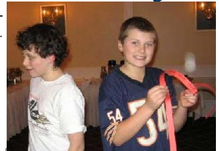
Future NEOC officers?