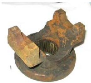
Lots of yolks were shared!

usually on the first Saturday evening in December. RR