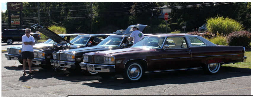
A nice showing of big cars at this year's show!

Thank you for your interest and long live all Classic Oldsmobiles! John Capone