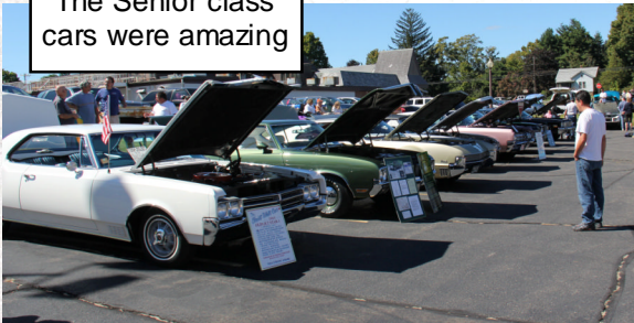
The Senior class cars were amazing