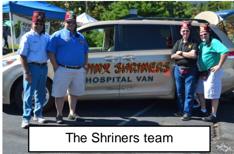
The Shriners team