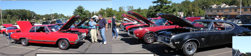
Plenty of '60's muscle in attendance