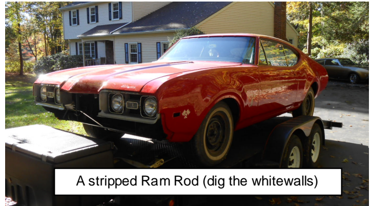
A stripped Ram Rod (dig the whitewalls)

The Ugly: My precious Ram-Rod has been stripped of all its glitter (chrome and moldings) and delivered to Schaller Auto Body for a new paint job. My 20 year old home grown paint job has finally deteriorated to the point where it needs a fresh coat of paint especially to compete in the OCA Senior judge class. I am so depressed. But I am optimistic.