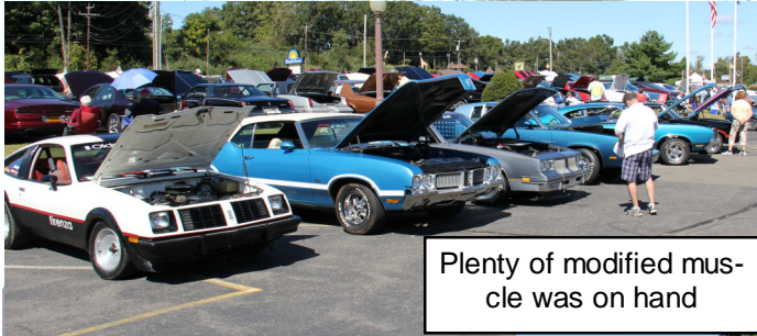
Plenty of modified muscle was on hand