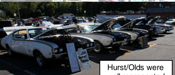
Hurst/Olds were well represented