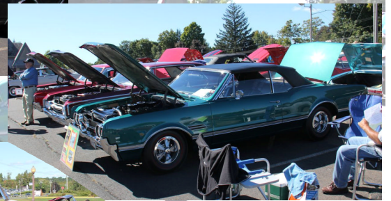
There were some nice unrestored cars that can be used for reference on the show field