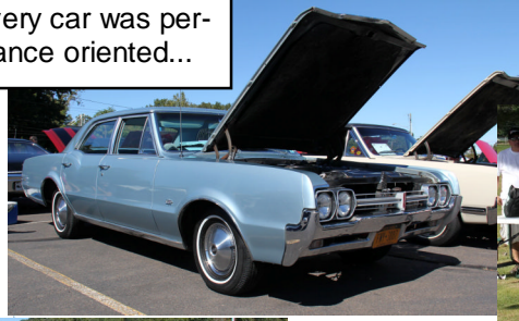
Not every car was performance oriented...