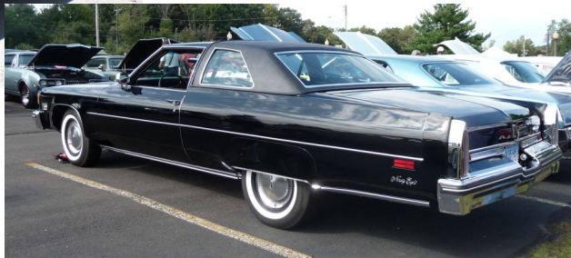
How'd you like to learn to parallel park THIS beast?

started fixing little things and learning what I could about cars. Fast forward to about 1995 when I went to my first OCA show in Merrick, Long Island where I saw something I never thought I would see....another black '76 Ninety Eight Regency and it was fully restored! The owner of this car and I obviously hit it off and have been good friends ever since. The instant I saw his car, I had to do whatever I could to make mine like his. I have spent a very, very long time (too long in most people's opinion) doing a complete frame-off restoration on my car and I don't regret it for a second. It is now about 95% complete and it even took home 2nd place at its very first show last September in Berlin, CT!! I've only put about 300 miles on the car since the rebuild and every one was worth a million bucks.