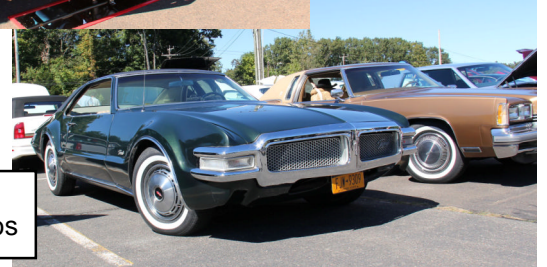
There was quite a selection of Toronados