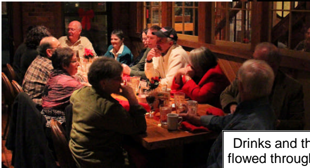
Drinks and the conversations flowed throughout the evening.