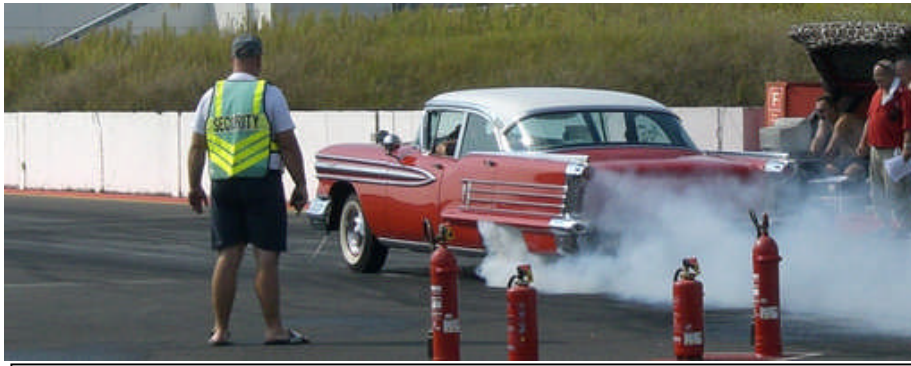
Bring out that Olds and see what it will do! It does NOT have to be a "Race car"!

The only change to the rules is that one driver can no longer bring two vehicles for a single entry fee. You may have one car with a single driver or two drivers for a one car for a single entry fee. Crew members and spectators are admitted free. All drivers, crew, and spectators must check in at the tower to sign the release waiver. Wristbands and run stickers will be issued.