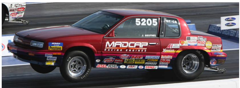
How do front drivers get traction with the wheels in the air?