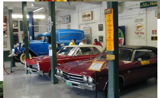
While there were no Oldsmobile's in the collection, the museum/garage was very