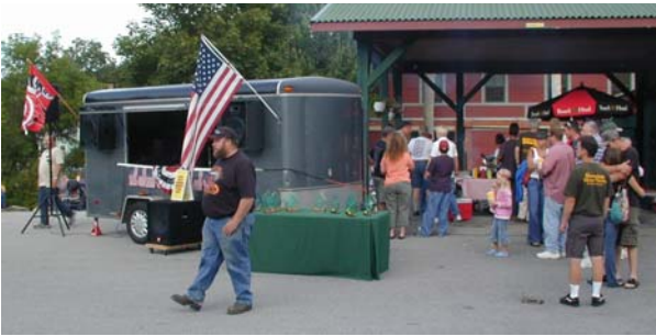
The DJ kept everyone entertained as well as on their toes with trivia. The food tent was busy all night.