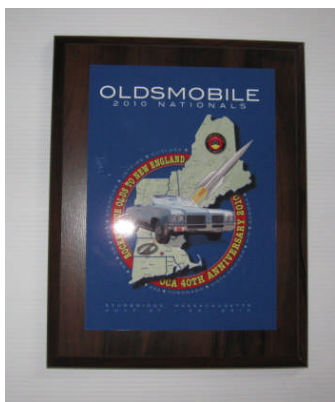
2010 Olds Nationals Show Plaques $10

2010 Oldsmobile Nationals 40th Anniversary Collector Edition Show Magazine $7