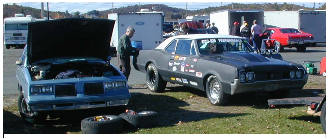
There's always action in the pit area between runs.

O nce again the speed demons headed up to that meca of speed called Lebanon Valley Dragway for a day of "tuning" to see just what they can get out of their rides. The original day unfortunately saw some poor weather so the day was moved to the rain date of October 13, Friday October 13<sup>th</sup> to be exact. Dismissing the cloud of doubt brought on by a Friday the 13<sup>th</sup> date at a racetrack, members still made the journey to test their skill (or should I say luck?).