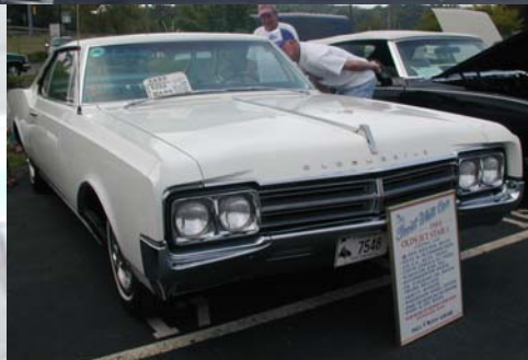
Let's hear it for the big cars! It's nice to see some tender care extended to those cars with the big back seats...