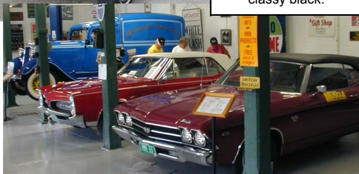
Part of the Hemmings Collection

Talk about service! When was the last time a uniformed attendant filled your car?