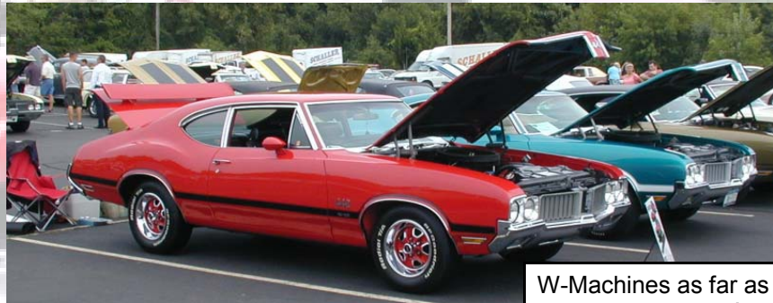
W-Machines as far as can see!