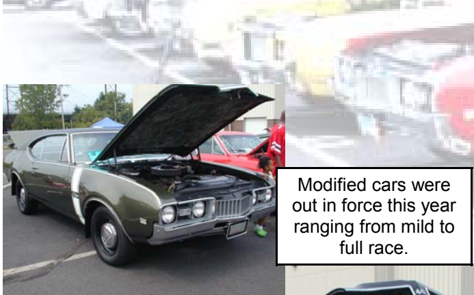
Modified cars were out in force this year ranging from mild to full race.