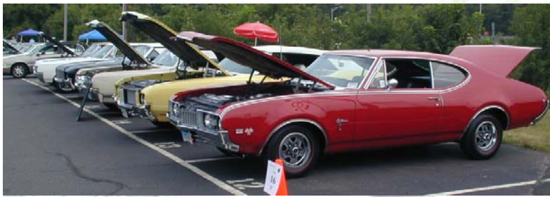
The Senior Class judges had a hard job with so many nice cars in the class!