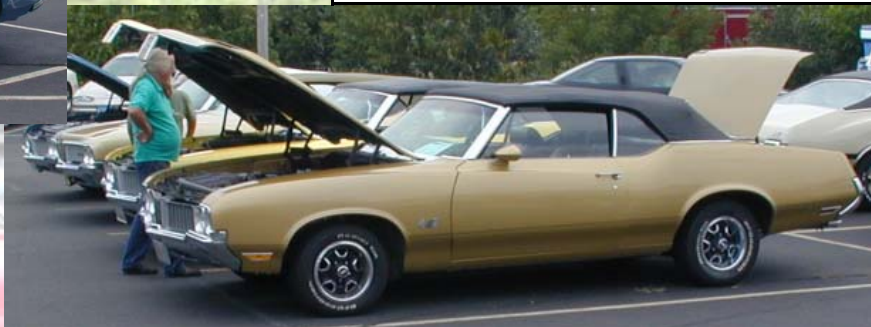
Convertible anyone? Most had their tops up from the showers that helped to clear off the dust from the drive.