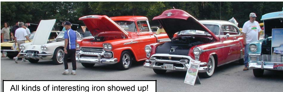
All kinds of interesting iron showed up!