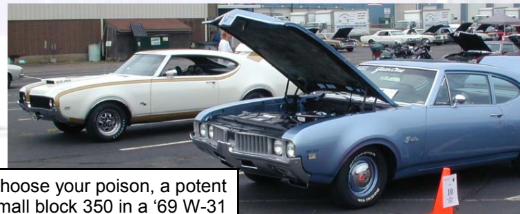
Choose your poison, a potent small block 350 in a '69 W-31 or the rule breaker H/O stuffed with 55 cubes more than the General allowed?