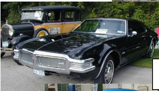
Nicely restored early Toronado dressed in classy black.