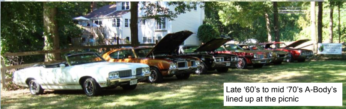
Late '60's to mid '70's A-Body's lined up at the picnic